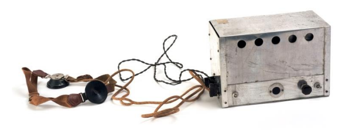
Amplified listening device

For the fictional aspects, ON Productions (London), the historical producer of James Bond , the Gaumont museum (Neuilly-sur-Seine), producer of OSS 117 by Michel Hazanavicius and Mandarin Productions, producer of the series Au Service de la France have exceptionally agreed to loan artefacts from their collections.