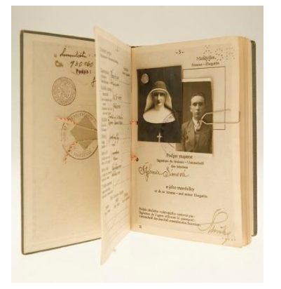
Passport of a Czechoslovakian agent operating under a false identity, passing herself off as a nun

It also describes the different types of agents, detailing their recruitment, training and the resources given to them to carry out their missions. Unlike the image portrayed in fiction, agents do not take on numerous roles, but each has their own speciality.