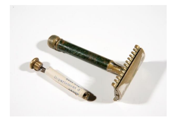
Razor with a hollow handle for hiding a message, which belonged to Lieutenant Raymond Moquet, alias Dumont, during the "Daru" mission (Second World War)