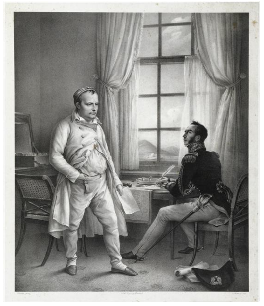
Charles Steuben, The Emperor in Saint Helena dictating his memoirs to General Gourgaud