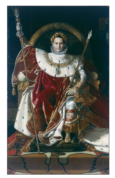
Napoléon ler by Ingres, Inv. 5420

Between 1804 and 1809, war strengthens and perpetuates the empire.