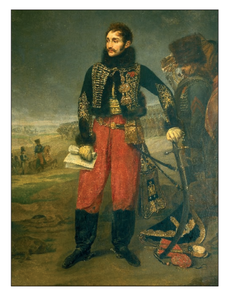
Le général Lasalle, by Gros, Inv. 19814 © Paris, musée de l'Armée, RMN-GP.

The Prussia campaign in 1806, room 26, starts with two French victories gained on October 14th in Iena and Auerstaedt. The cavalry chases down the remains of the Prussian army in retreat. This campaign allows to present uniforms and weapons specific to the hussars and the chasseur horsemen of the light cavalry. Iconography is dominated by a work of baron Gros, a great full-size portrait of Lassalle in front of Stettin (October 30th, 1806).