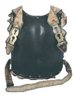
Turenne's breastplate. Inv. 6668.I

Two great military leaders are then evoked in the rooms dedicated to the King's entourage: Turenne (1611-1675, room 7) and Vauban (1633-1707, room 9). Let us recall that, on Napoleon's initiative, Turenne's tomb and a funeral monument in honour of Vauban are placed in the Dome church of the Invalides. In connection with Vauban, a fortification specialist, small models of artillery and the calibre 4 canon, named "La Pie", are gathered.