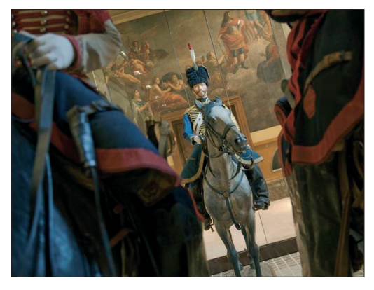
The Vauban room

The Vauban room (at left as you enter), presents (outside temporary exhibits), in a large central window (33 m.), 13 life-size equestrian models which joined the museum collections between 1897 and 1901. This set brings back to life the general look of the cavalry from the Consulate to the 2nd Empire, and reminds that horses played during centuries the key role for speed, suprise and shock troops.