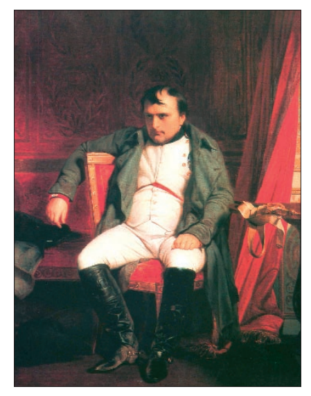
Napoléon № à Fontainebleau by Delaroche, 1840, Inv. 11931