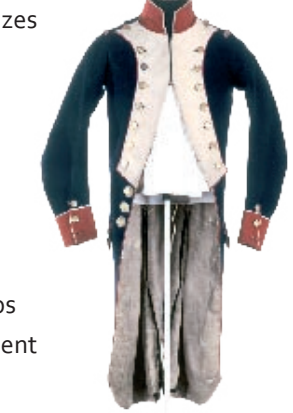
Infantry uniform of an officer, vers 1793, Inv. 0271

As far as weaponry is concerned, continuity between the Ancient Regime and the Revolution is highlighted in the corridor, in spite of the production of a few new models. The regulated rifle, model of 1777, still equips the revolutionary and imperial armies. The artillery system in use is the one refined at the end of the Ancient Regime by Gribeauval, small models of which can be seen in room 28.