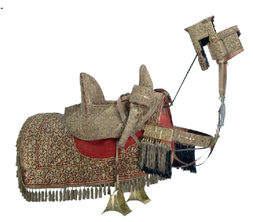
Mamelouk's harness from Pyramides battlefield, Inv. 5171 I © Paris, musée de l'Armée, RMN-GP.

Napoleon Bonaparte's demand, brings back to life this battle of the first Italy campaign (1796-1797), which proved to be decisive for Bonaparte both military and political future. The second Italy campaign (1800) takes place in room 256, around a carriage, a unique object purpose-manufactured for the crossing of the Alps. Germany (1796-1798) and Helvetia (1799) campaigns occupy the corridor between the two rooms.