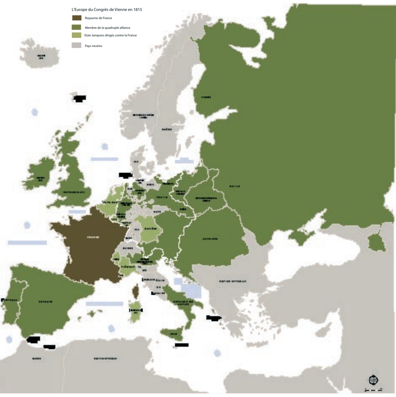
Europe after Vienna conference in 1815

In June 1815, the Congress of Vienna reorganizes Europe according to the interests of the four victorious powers of Napoleon (Britain, Russia, Austria, Prussia). This conference is the largest meeting of diplomats and sovereigns since the Peace of Westphalia in 1648. Against the proposed Napoleonic hegemony, it restores the principle of balance of power, but without taking into account the aspirations of peoples. France, isolated, experiences a territorial decline and is placed under allied watch. Britain is the main beneficiary of the Peace of Vienna: ruling the seas, it is no longer bothered by the French presence in Belgium, which is united to Holland within the Kingdom of the Netherlands. Austria acquires large possessions in Northern Italy (Venetia and Lombardy). Prussia expands in the Rhine region, while Russia is assigned a large part of Poland, the rest of which is under Prussian and Austrian rule. As for Germany, it remains fragmented in a Germanic Confederation reduced to 39 states (instead of over 300 in 1789).