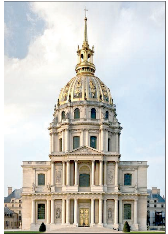
Dôme of les Invalides facade

The building rests on a nearly square basis, and is covered by a terrace topped by a dome which rests on a tambour. The south-facing front of the building is preceded by a salient frontispiece, which constitutes the monumental entrance of the royal church. It is structured by a strong cornice and a set of columns, lined up and stacked up, with their architectural order changing at each level. The pediment which caps the front gate brings up the glance towards the dome. On both sides of the entrance, the big statues of Saint-Louis by Nicolas Coustou and Charlemagne by Coysevox are an introduction to the ornamental discourse.