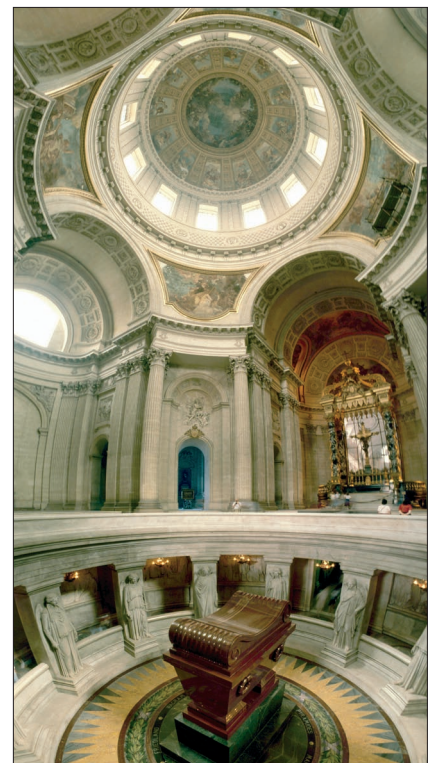
Inside the Dôme des Invalides, with Napoleon's tomb

Construction works last for about thirty years, delayed and limited by financial constraints caused by the constant wars of the kingdom. Hence, Hardouin-Mansart has to give up his project of a great square surrounded in part by a colonnade, next to the south side of the building, which would have completed the access to the royal church.