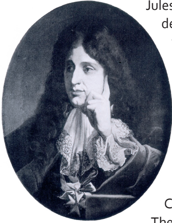
Jules Hardouin-Mansart.

Jules Hardouin-Mansart (1646 - 1708) is a young, well-known architect when Louvois asks him to design a monumental church for the Invalides, since Bruant, previously in charge of the construction work, failed to do so. Hardouin-Mansart quickly responds by adapting an uncompleted project of a funeral chapel designed by his great-uncle François Mansart for the Bourbons in Saint-Denis. Hardouin-Mansart builds on what's already there : Bruant's nave remains, with its north entrance allowing the old soldiers daily worship, while the king has his own grandiose access on the south side.