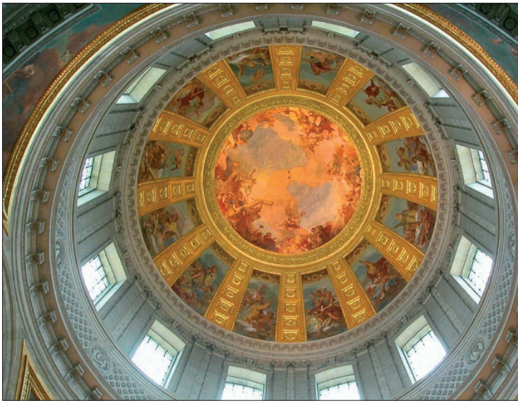
Inside the Dôme des Invalides © Musée de l'Armée, RMN-GP.

Inside, even if the stonework prevails in the lower parts, the painting on the embedded cupolas immediately catches the glance.