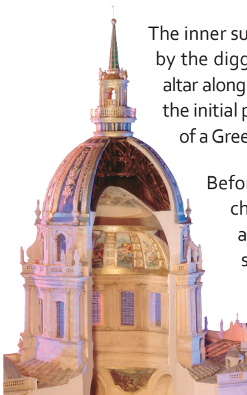
Dôme of Les Invalides' model scale (1/100) by P. Velu. Inv. 997.761

The tambour consists of two levels of unequal heights. The second level of the tambour has small windows which are invisible from inside the building : as part of an ingenious system of embedded cupolas, they light up the painting on the upper dome. The dome itself is capped by a small lantern, carrying a spire decorated with fleurs-de-lis topped with a cross. The building as a whole soars skywards and reaches 101 meters (331,4 feet). The patterned, golden roof highlights the impression of lightness and emphasizes the cross on the top of it. The royal church remained the highest building in Paris until the Eiffel tower was built.